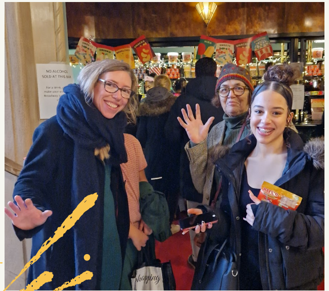
CATFORD BROADWAY THEATRE