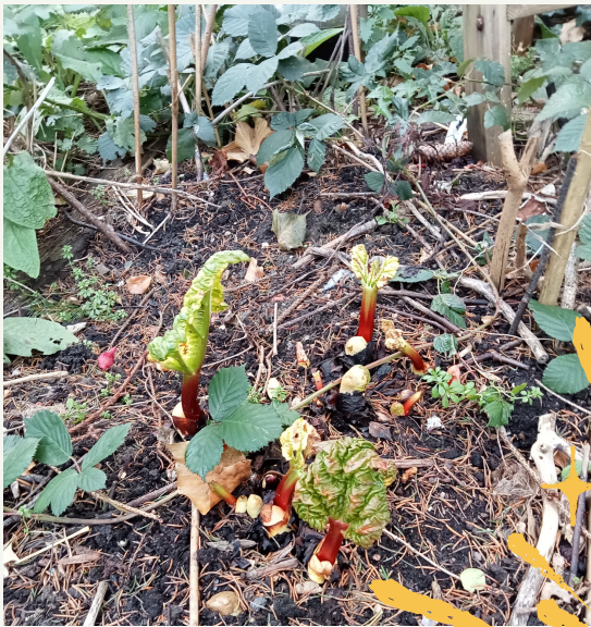
FRIENDLY ST ALLOTMENTS